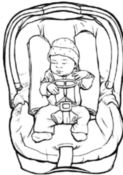
Figure 4: Car seat with a small cloth between crotch strap and infant, retainer clip positioned at the midpoint of the infant's chest, and blanket rolls on both sides of the infant.

A: Blanket rolls may be placed on both sides of the infant and a small diaper or blanket between the crotch strap and the infant. Do not place padding under or behind the infant or use any sort of car seat insert unless it came with the seat or was made by the manufacturer of the seat.