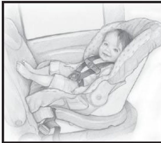
Figure 2: Rear-facing car seat.

When children reach the highest weight or length allowed by the manufacturer of their rear-facing only seat, they should continue to ride rear-facing in a convertible seat or 3-in-1 seat.