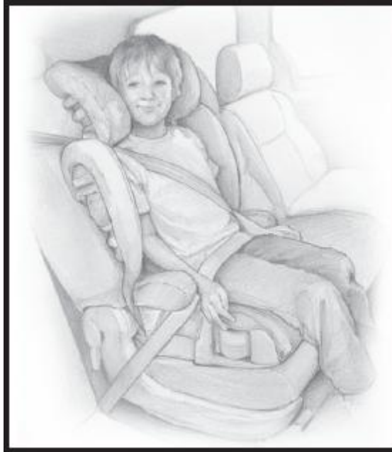
Figure 6: Belt-positioning booster seat