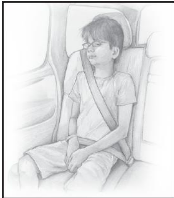
Figure 7: Lap and shoulder seat belt.

Seat belts are made for adults. Children should stay in a booster seat until adult seat belts fit correctly (usually when the child reaches about 4 feet 9 inches in height and is between 8 and 12 years of age). When children are old enough and large enough to use the vehicle seat belt alone, they should always use Lap and Shoulder Seat Belts for optimal protection.