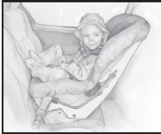
Figure 3: Convertible car seat used rear-facing.