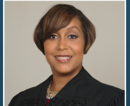
Judge Fatima El-Amin