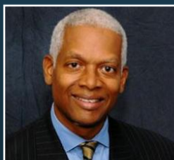
Congressman Hank Johnson